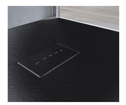
Drain cover detail.