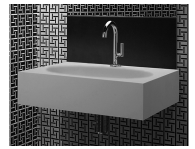
Also available as a wall-mount sink, MTCS-719D. See product specification sheet for details.