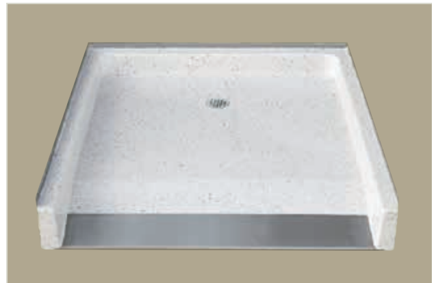
Model 500 Barrier free Terrazzo Shower Receptors with built-in stainless steel ramp.

Note: Terrazzo is not designed to be used with anything that is over 130 degrees Fahrenheit.