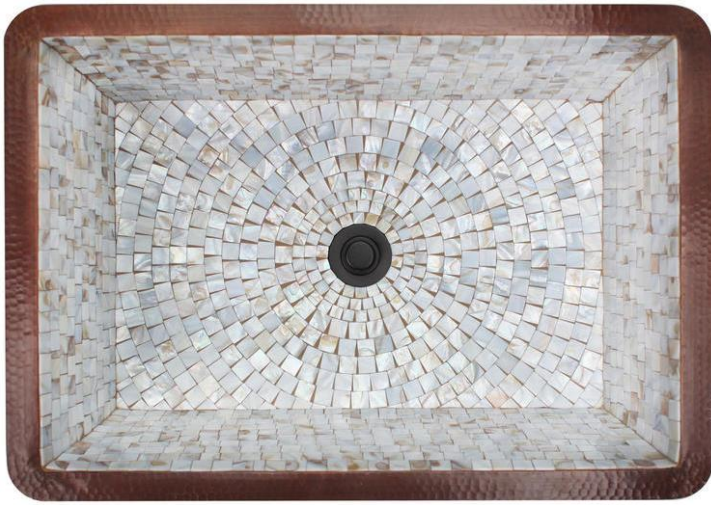
Showing a V018 WC-A-18-D005 DB